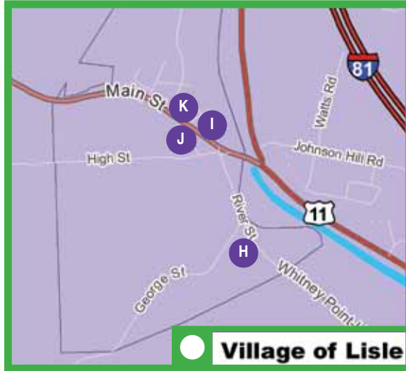
Village of Lisle