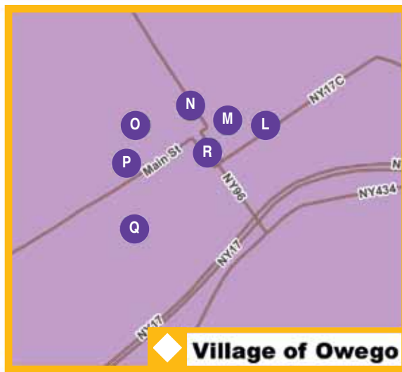
Village of Owego